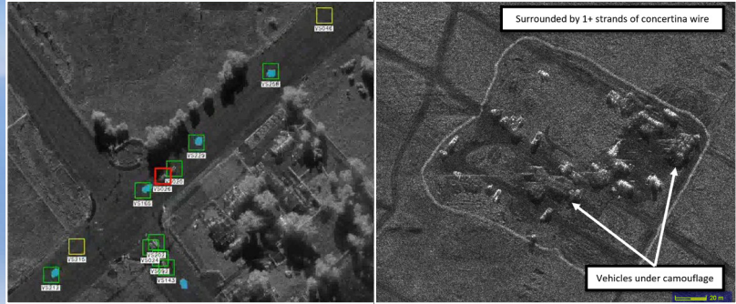
Moving Target Tracking