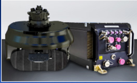
Multi-Domain / Multi-Mission Radar

General Atomics Aeronautical Systems, Inc.'s state-of-the-art Lynx Synthetic Aperture Radar (SAR) provides next-generation intelligence, surveillance, and reconnaissance for manned and unmanned aircraft. Lynx SAR maritime surveillance, SAR and ISAR imaging, and moving target tracking with Moving Target Indicator (MTI) or with SAR full-motion video, enable the aircraft to provide high-resolution precision imagery in the most challenging environments and under adverse weather conditions. Ready for any mission, whether domestic or expeditionary, Lynx SAR provides a bird's eye view to deliver unmatched situational awareness to the warfighter.